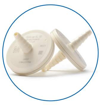
Bubble trap vent