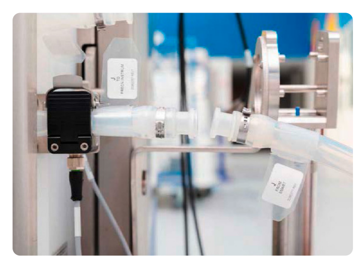
Flexware® clamshell assembly labels.

All modes of operation are enabled with specifically designed flow path, allowing to reduce contamination risk and protect operators. The switch between modes of operation is straightforward.