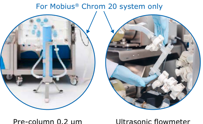
Pre-column 0.2 µm filter and its support for protecting the column

The system options and accessories include: