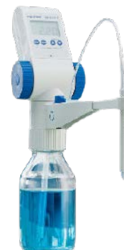
Eppendorf Top Buret™