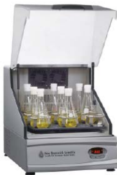
New Brunswick™ Excella® E24/ E24R Incubator Shaker