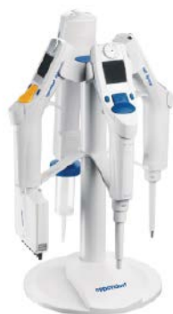
Eppendorf Repeater® E3/E3x & Eppendorf Xplorer® plus Pipette