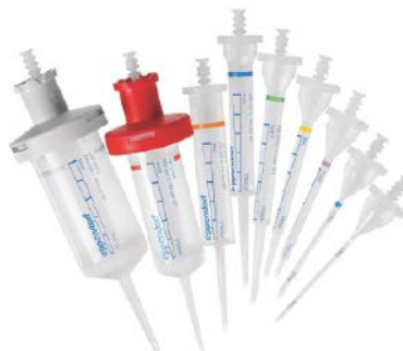
Eppendorf Combitips advanced®