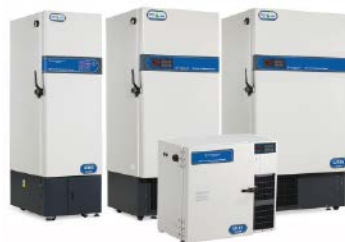
New Brunswick Innova® ULT Freezers