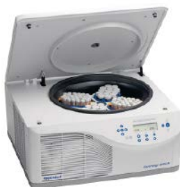
Eppendorf Centrifuge 5920 R