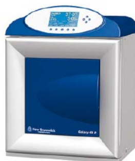
Eppendorf® Galaxy® 48 R CO2 Incubator

To view the entire portfolio of products, visit: SigmaAldrich.com/Eppendorf