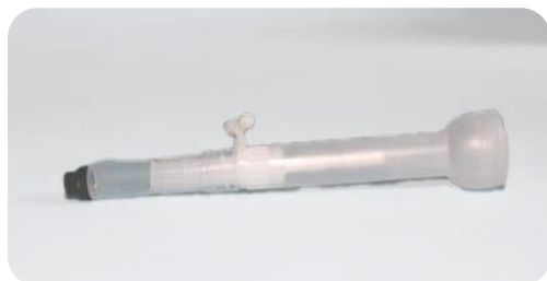
Fit Cable Twist to Pen as shown