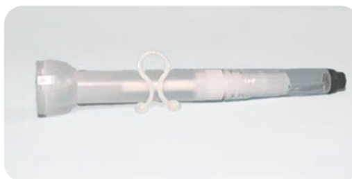
Cable Twist and Pen