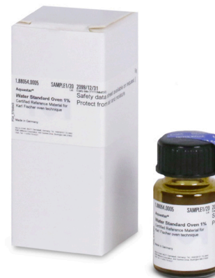
Fig. 2 Oven standard