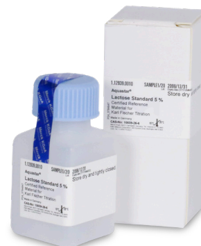
Fig. 4 Lactose Standard

The AquaStar® lactose standard is a solid standard containing approximately 5% water. The batch-specific Certificate of Analysis provides the precise water content for each batch. This versatile standard can be utilized in both coulometric and volumetric Karl Fischer titrations, thanks to its solubility in methanol and water content. It is particularly useful when working with solvent mixtures where sodium tartrate dihydrate has low solubility. Additionally, it can serve as an oven standard within a temperature range of 140-190 °C.