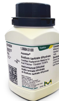
Fig. 5 Sodium tartrate

Sodium tartrate dihydrate is a solid standard used in volumetric Karl Fischer titration. It contains a precise water content of 15.66% and is suitable for titer determination and result verification.