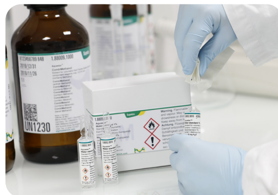
Fig. 1 Water standards in ampoules