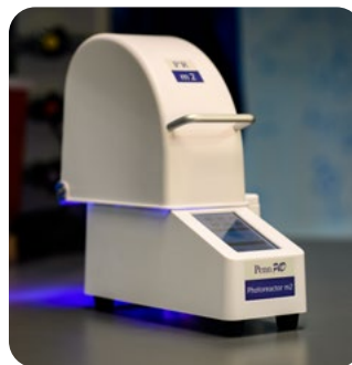
Penn PhD Photoreactor m2 (Z744035)

The Penn PhD Photoreactor m2 is a benchtop instrument designed for you to accelerate chemical reactions using photoredox catalysis. The Photoreactor m2 combines LED illumination, mechanical stirring, and cooling into one device. Define parameters of temperature, intensity, stir rate and time to improve repeatability, traceability, efficiency, and consistency of your results. The Photoreactor m2 allows you to streamline synthetic sequences and create valuable strategies for addressing some of the challenges of molecule construction in drug discovery.