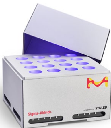
SynLED parallel photoreactor (Z744080)

The SynLED Parallel Photoreactor 2.0 is the next generation in the SynLED product line. It was designed to facilitate reaction optimization as well as rapid library synthesis ensuring high levels of consistency across reactions and between runs.