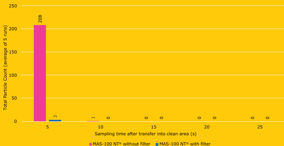
Figure 2: Transfer of particles from high to low contaminated environments.