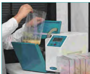
1. Sample preparation (enrichment, plating)