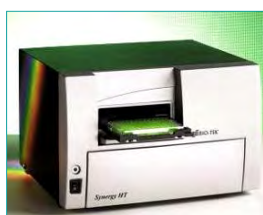
8. Signal read out /Test analysis