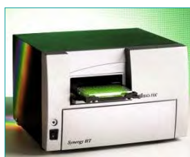
8. Signal read out / Test analysis