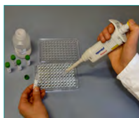
5. Enzyme coupling (Coupling of enzyme to "sandwich complexes", 10 min)