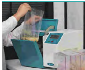
1. Sample preparation (enrichment, plating)