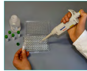
3. Hybridisierung & Immobilisierung (Bindung spezifischer Sonden an die Probe im Zell-Lysat, 15 min)