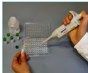
5. Enzymreaktion (Kopplung des Enzyms an die Komplexe, 10 min)