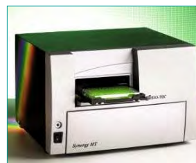
8. Messsignal fotometrisch auslesen