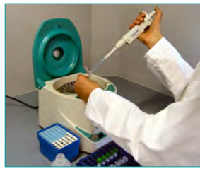
2. Zell-Lyse (2 ml Probe oder Bakterienkolonie)