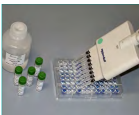
7. Farbreaktion (Farbreaktion und Abstoppen, 2-15 min)