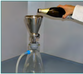
1. Probenaufschluss & Anreicherung, (optional Plattieren)