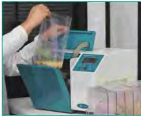
1. Sample preparation (optional enrichment)