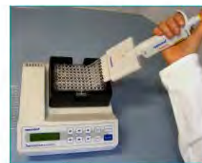
6. Washing (Removal of unbound components, 2 x 1 min)