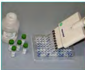
7. Colour reaction (10 min)