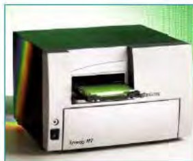
8. Signal read out (10 min)