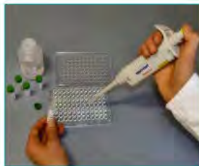
5. Enzyme coupling (Coupling of an enzyme to the "sandwiches", 10 min)