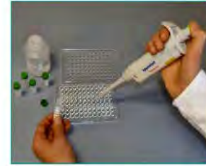
3. HybriScan® test solution (Forming of "sandwich complexes" between specific probes and the sample, 10 min)