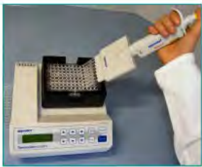
4. Immobilisation (Binding of the "sandwiches" to the binding plate, 10 min)