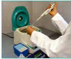
2. Cell lysis (2 mL sample, 13,00 rpm; 37°C, 45 - 60 min)