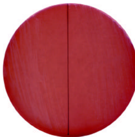
Streptococcus agalactiae ATCC 13813