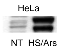
Figure 2. Immunoprecipitation/Western Blot analysis of JNK/SAPK1 (Thr183/Tyr185) in HeLa cells. HeLa cells were grown to confluence and then lysed in MILLIPLEX ® MAP Lysis Buffer with protease inhibitors. 20 µg Non-treated (NT) or HS/Ars-treated HeLa cell lysates were mixed with JNK/SAPK1 capture antibody beads to immunoprecipitate JNK/SAPK1 from each cell lysate. The immunoprecipitated proteins were separated on SDS-PAGE, transferred to nitrocellulose, and probed with biotin labeled Phospho JNK/SAPK1 detection antibody. The proteins were imaged using Streptavidin-HRP and chemiluminescent substrate.