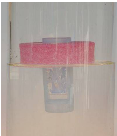
Figure 2: Dialysis with Mega Pur-A-Lyzer.