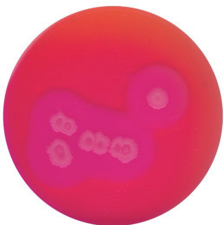
Bacillus cereus ATCC® 11778 on MYP agar

Please refer to the actual batch related Certificate of Analysis.