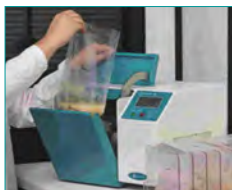
1. Sample preparation (optional enrichment)