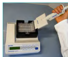
6. Washing (Removal of unbound components, 2x 1 min)