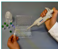
5. Enzyme reaction (Coupling of an enzyme to the „sandwiches“, 10 min)