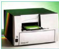
8. Signal read out