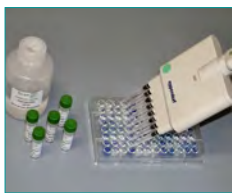
7. Color reaction (10 min)