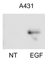
Figure 2. Immunoprecipitation/Western Blot analysis of Phospho STAT1 (Tyr701) in A431 cells. A431 cells were grown to confluence and then lysed in MILLIPLEX ® MAP Lysis Buffer with protease inhibitors. 10 \mu g Non-treated (NT) or EGF-treated A431 cell lysates were mixed with STAT1 capture antibody beads to immunoprecipitate STAT1 from each cell lysate. The immunoprecipitated proteins were separated on SDS-PAGE, transferred to nitrocellulose, and probed with biotin labeled Phospho STAT1 detection antibody. The proteins were imaged using Streptavidin-HRP and chemiluminescent substrate.