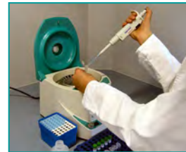
3. Centrifugation/Cell-Lysis (2 ml sample, 13.000 rpm; 37°C, 45-60 min)