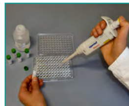
5. Immobilisation (Binding of the „sandwiches“ to an affinity plate, 15 min)