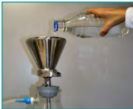
1. Sample filtration (1000 ml water, 15 min)