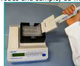
7. Washing (Removal of unbound components, 2x1 min)