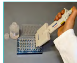
6. Enzym coupling (Coupling of an enzyme to the „sandwiches“, 25 min)