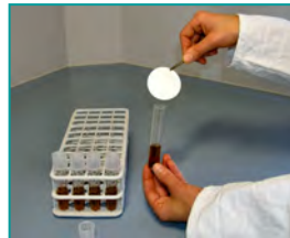
2. Filter incubation (BCYE, 36°C)