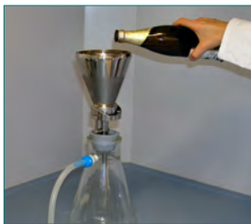
1. Sample preparation (enrichment, plating)