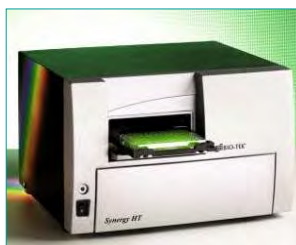
8. Signal read out /Test analysis