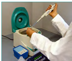
2. Cell lysis