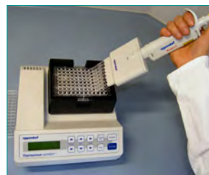
6. Washing (removal of unbound components, 2x1 min)