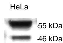
Figure 2. Immunoprecipitation/Western Blot analysis of Total JNK/SAPK1 in HeLa cells. HeLa cells were grown to confluence and then lysed in MILLIPLEX ® MAP Lysis Buffer with protease inhibitors. 20 µg Non-treated (NT) HeLa cell lysates were mixed with JNK/SAPK1 capture antibody beads to immunoprecipitate JNK/SAPK1 from each cell lysate. The immunoprecipitated proteins were separated on SDS-PAGE, transferred to nitrocellulose, and probed with biotin labeled Total JNK/SAPK1 detection antibody. The proteins were imaged using Streptavidin-HRP and chemiluminescent substrate.