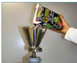
1. Sample filtration (250 – 1000 ml water, 15 min)