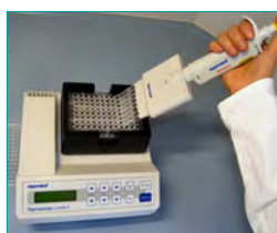
5. Immobilisation (Binding of the "sandwiches" to the binding plate, 10 min)