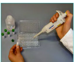
4. HybriScan® test solution (Forming of "sandwich complexes" between specific probes and the sample, 10 min)