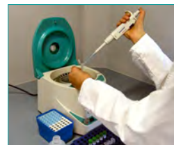
3. Cell lysis (2 ml sample, 13.000 rpm; 37°C, 45-60 min)