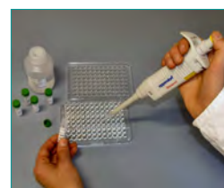
6. Enzyme coupling (Coupling of an enzyme to the "sandwiches", 10 min)