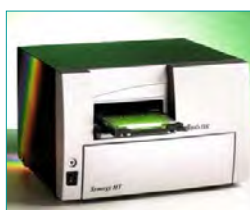
8. Signal read out (Colour reaction and signal read out, 15 min)