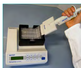
6. Washing (Removal of unbound components, 2 x 1 min)