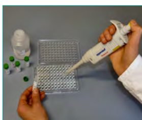
5. Enzyme coupling (Coupling of an enzyme to the "sandwiches", 10 min)