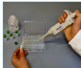
3. HybriScan® test solution (Forming of "sandwich complexes" between specific probes and the sample, 10 min)