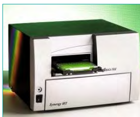
8. Signal read out (10 min)