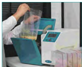
1. Sample preparation (optional enrichment)