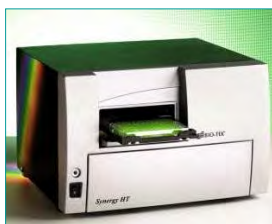
8. Signal read out