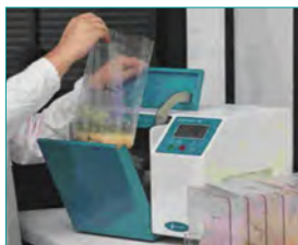
1. Sample preparation (optional enrichment)