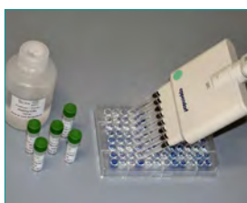
7. Color reaction (10 min)