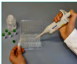
5. Enzyme reaction (Coupling of an enzyme to the „sandwiches“, 10 min)