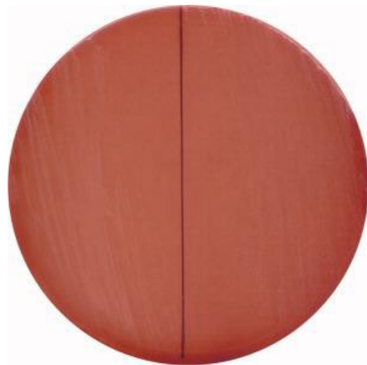
Streptococcus agalactiae ATCC 13813