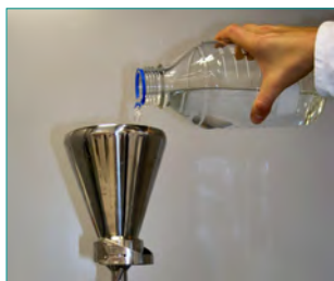
1. Sample preparation (enrichment, plating)