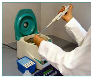
2. Cell lysis