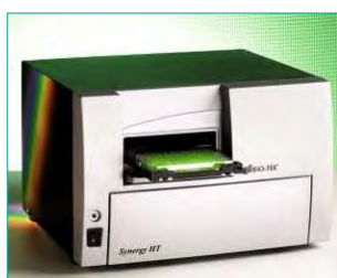
8. Signal read out /Test analysis