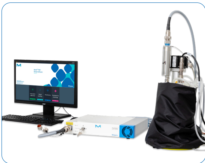
Figure 1: ProCellics™ Raman Analyzer probe immersed into the bioreactor, protected from external straylight with a lightproof fabric. The instrument is controlled by Bio4C™ PAT Raman Software.