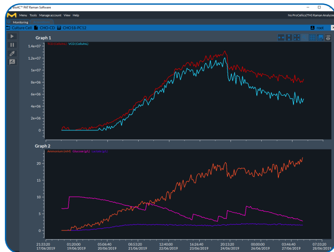
Figure 2: Real-time monitoring of a CHO cell culture (red: TCD, light blue: VCD, orange: ammonium, pink: glucose, purple: lactate).

The use of Raman spectroscopy to monitor process parameters first requires chemometric model building with a calibration dataset. In this study, Raman spectra from three independent culture runs were collected using the ProCellics™ Raman Analyzer, preprocessed by Bio4C™ PAT Raman Software and used to build chemometric models for TCD, VCD, concentration of glucose, lactate and ammonium. These models were used by the Bio4C™ PAT Raman Software for real-time monitoring of process parameters for a new cell culture run from the acquired Raman spectra ( Figure 2 ).