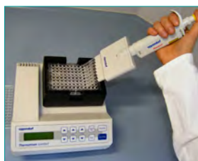
4. Immobilisation (Binding of the „sandwiches“ to the binding plate, 10 min)