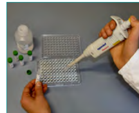
3. HybriScan® - test solution (forming of „sandwich complexes“ between specific probes and the sample, 10min)