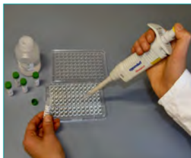
5. Enzyme reaction (Coupling of an enzyme to the „sandwiches“, 10 min)