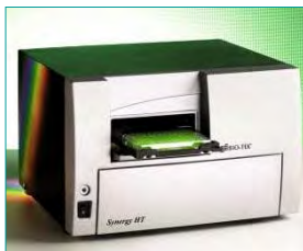
8. Signal read out